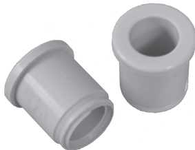
Standard Duty Bushings

Flange: 1/8" O.D.: .881" Length: 1 1/2" GIR Length: 1 3/4"