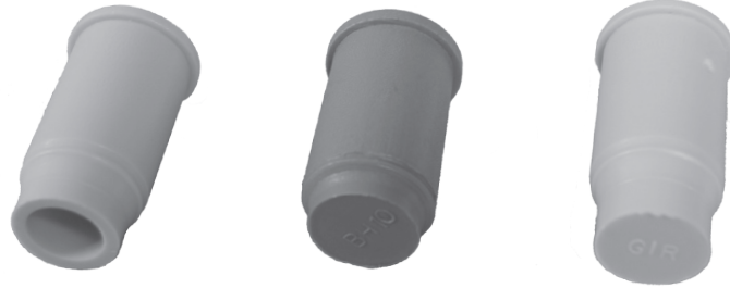
Heavy Duty Bushings