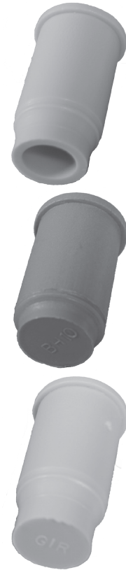
Heavy Duty Bushings

Flange: 1/8" O.D. .881" Length: 1 1/2" GIR Length: 1 3/4"