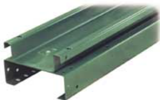
DETAIL OF INTERMEDIATE BED SECTION

ELECTRICAL CONTROLS: Magnetic starter (one direction or reversible); One direction manual starter; Momentary start/stop push button station; Forward/reversing /stop push button station. Mounting and pre-wiring for units up to 12' long.