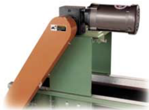
OPTIONAL OVERHEAD MOUNTED DRIVE