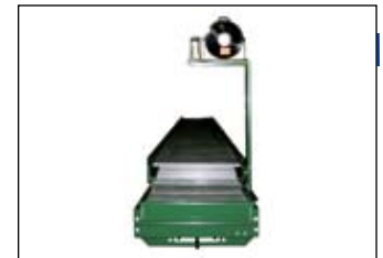
Fan and Light