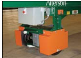
Changeable Drive System